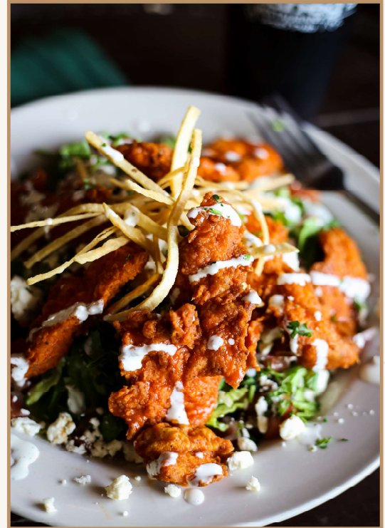
BUFFALO BLEU SALAD

Seasoned and grilled jumbo shrimp with garden fresh lettuce, slices of creamy avocado, apple wood smoked bacon, roasted corn, tomatoes, and a hard boiled egg. 14.99