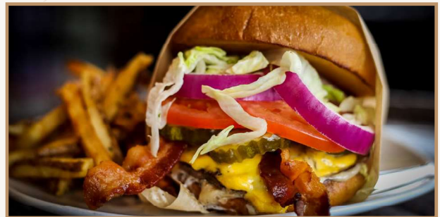
THE OWNER'S BURGER

Our seasoned ½ pound all beef patty seared and topped with a large farm fresh sunny side egg, apple wood smoked bacon, and melted cheddar jack. Served on a toasted Brioche bun with all the garden fixins'. 13.99